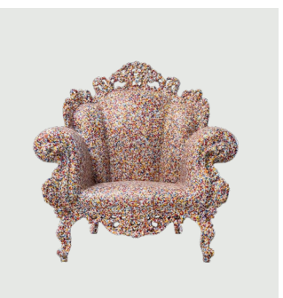
Multicolour w/ white background