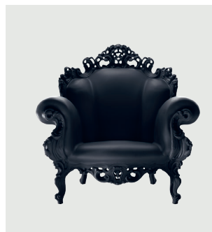
Black 1763 C